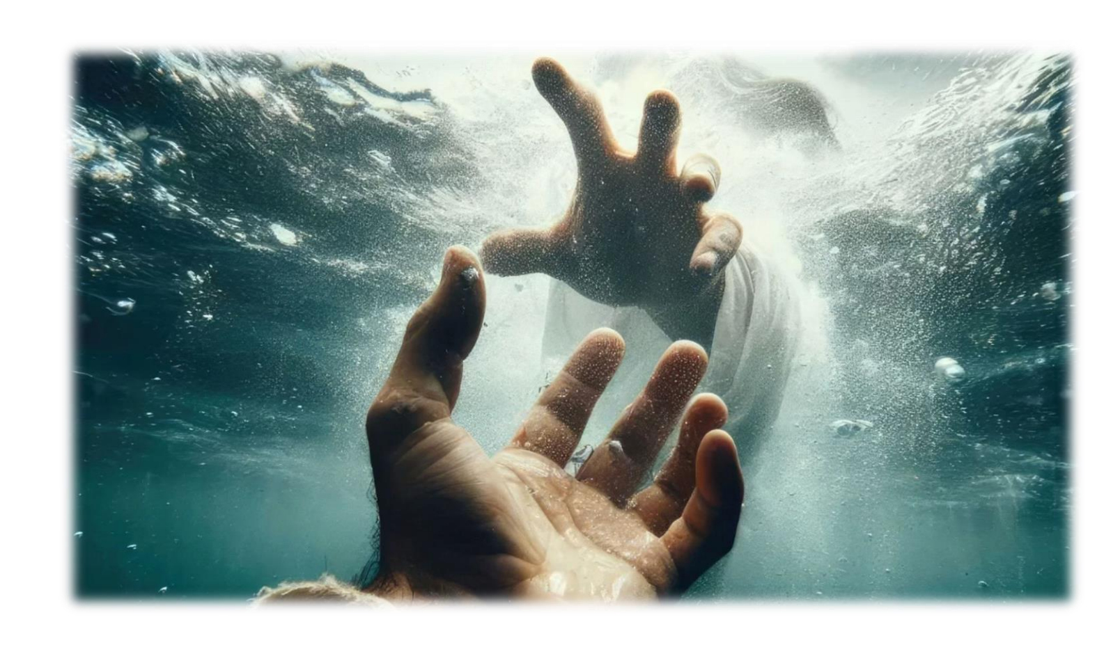
June 30, 2024 Worship Bulletin