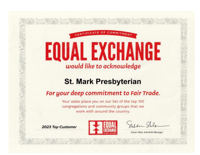
St. Mark Recognized as Top 100 Supporting Customer by Equal Exchange

*Non-food products such as pull-ups and baby wipes cannot be purchased with food stamps.